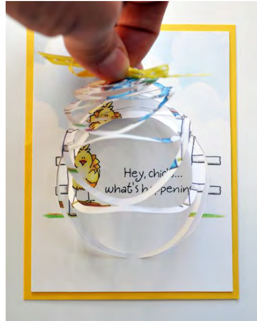
Finished Project - Opened